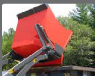
64" Hydraulic High Dump into Dumpster