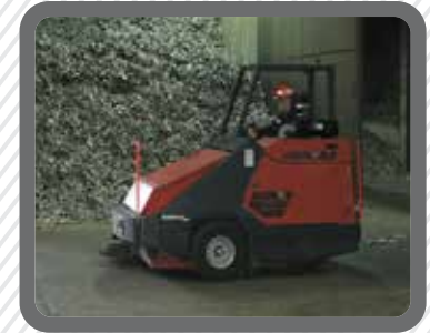
Built To Last In The Most Rugged Environments