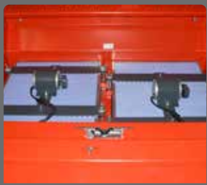
(2) Filters 120 SQ FT