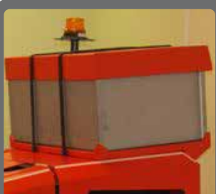
MERV 17 Filtration