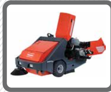
Swinging Engine for Exceptional Access

Stage 5: (MERV 17 HEPA) 99.97% efficiency on 0.30 pm particles